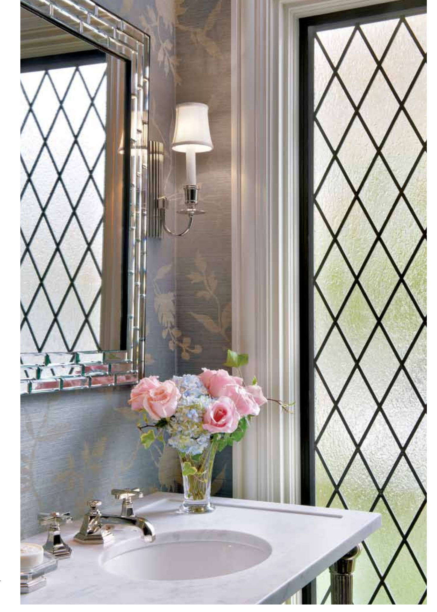
Swathed in a silvery blue wallcovering from Brunschwig & Fils, the powder room features a white vanity and gleaming fixtures from Kallista. The mirror, by Vaughan, gets an ambient glow from sconces by Chameleon Fine Lighting in New York.